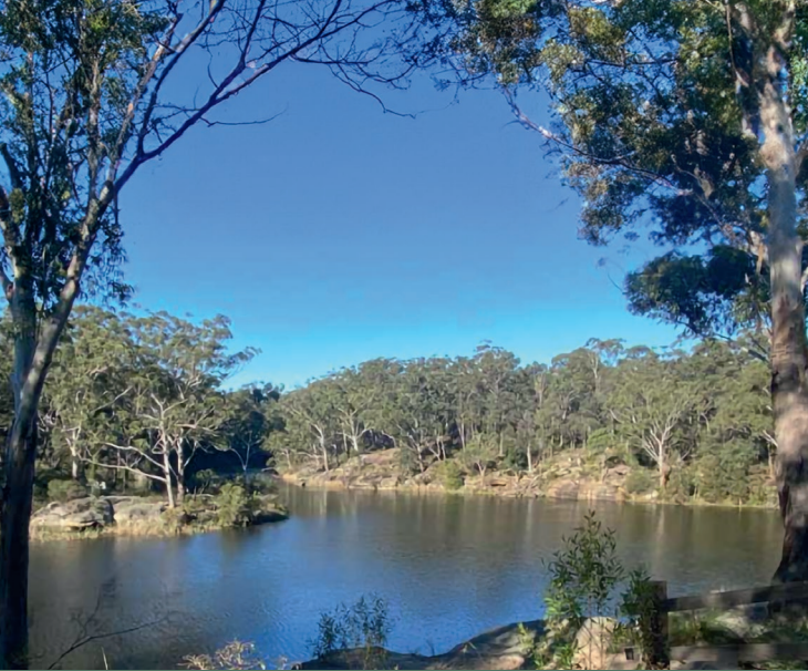
View along Parramatta Lake.