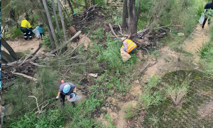
Clean up at Toongabbie Creek. Note flood damage.